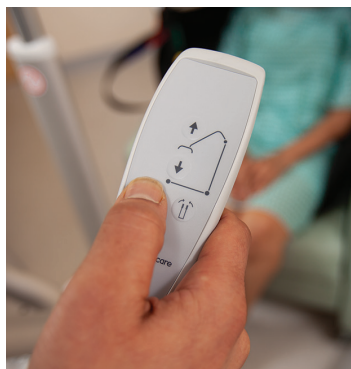
Ergonomic and easy-to-use hand control with 4 buttons.

Eva floor lifts have an emergency stop button easily accessible on the control box. The lift also has both electrical and manual emergency lowering. The battery has high capacity, performing many lifts per charge, which means less frequent charging. An indicator on the control box shows when charging is in progress and when the battery is fully charged. Built-in charging is standard.