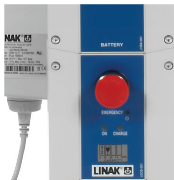
New control box with diagnostics, e.g. lift counter and overload indicator.